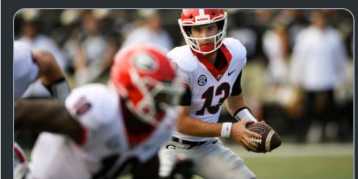
Georgia nipping on Alabama's heels in W...