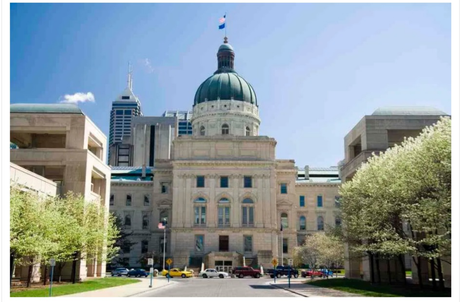
State Capitol Building in Indianapolis, Indiana